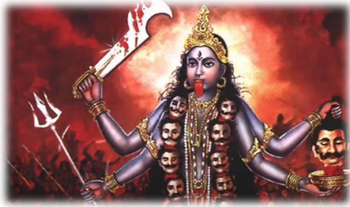
Hindu goddess Kali

“Sticking out your Tongue girl” Phrase used throughout the music video