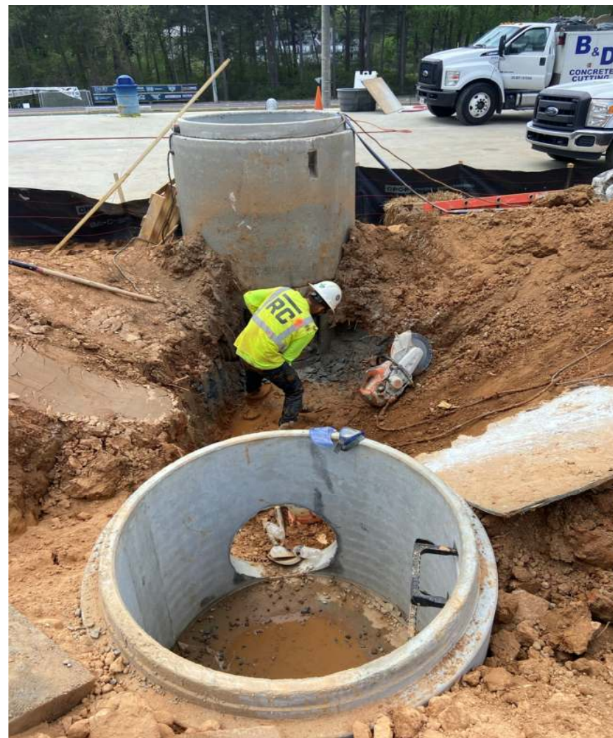
STRUCTURES B-1 AND B-2