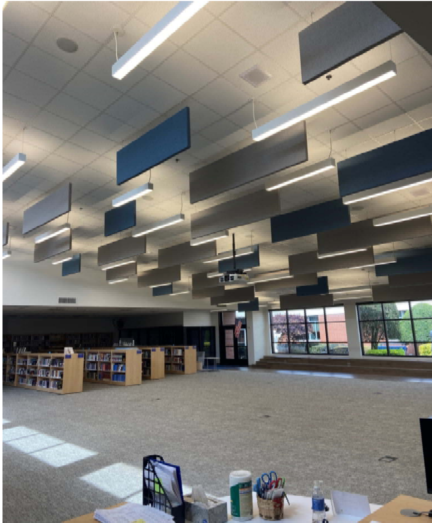
ACOUSTICAL BAFFLES IN THE MEDIA CENTER