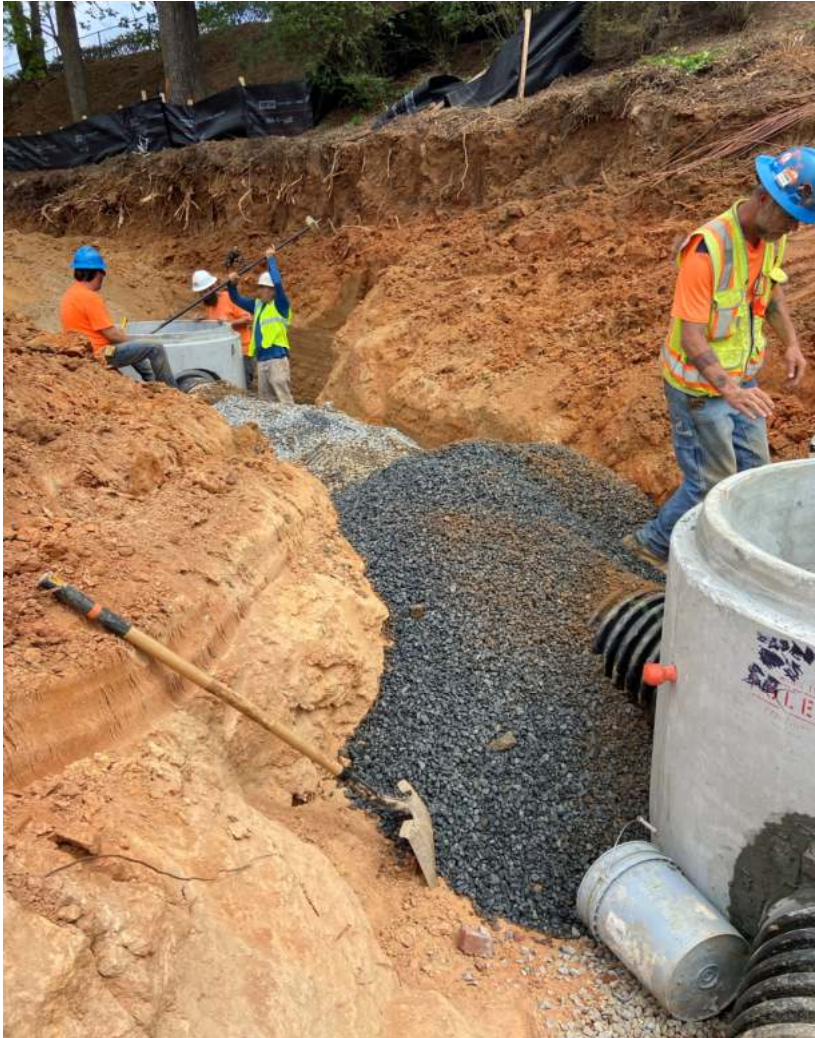
STORM LINE AND STRUCTURES FROM B-3 TO B-4