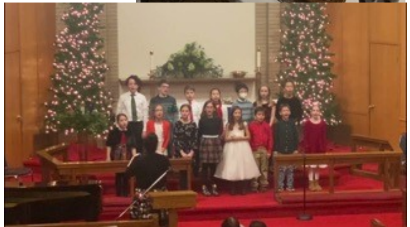
Christmas Concert - Sounds of the Season - Youth Choir