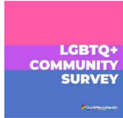
Community Survey Social Media - Bi