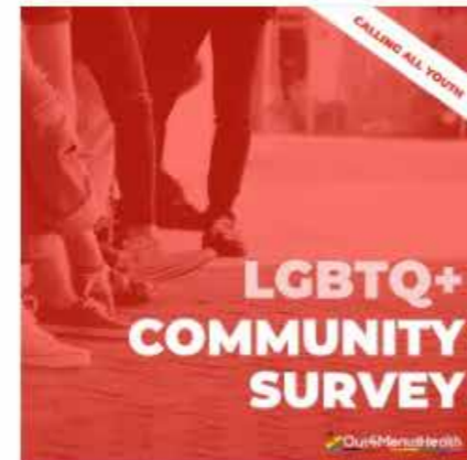
Community Survey Social Media - Youth