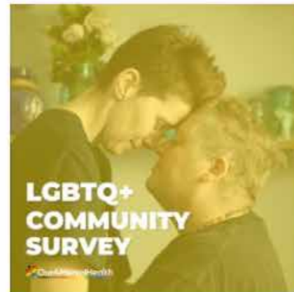
Community Survey Social Media - Queer