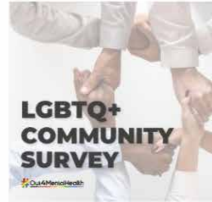
Community Survey Social Media - Diverse