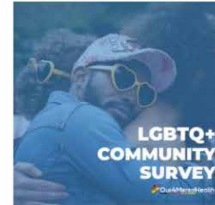
Community Survey Social Media - Men 2