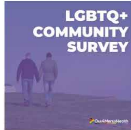
Community Survey Social Media - Men