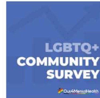
Community Survey Social Media