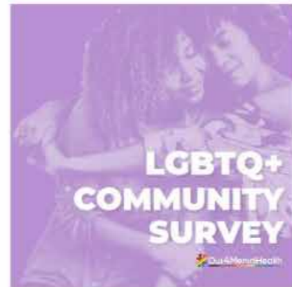
Community Survey social Media - Women