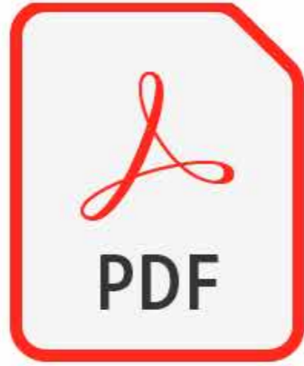
Community Survey Flyer