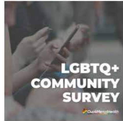
Community Survey Social Media - Mobile