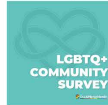
Community Survey Social Media - Polyam