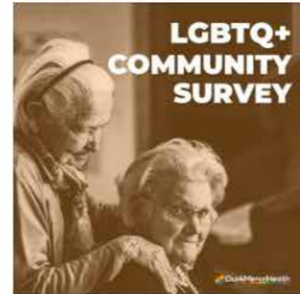
Community Survey Social Media - Older adults