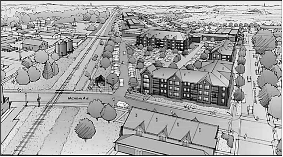
This drawing provided by Vandewalle & Associates shows some former Tecumseh site redevelopment concepts. This is from Michigan Avenue looking north.

■ City's website: www.cityofnewholstein.org