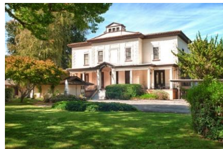
The Vallombrosa Center

Please note: Vallombrosa is not fully ADA compliant. For details, contact jaynie@vallombrosa.org .