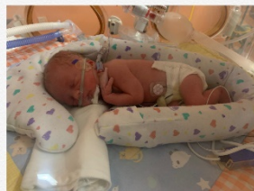
Ruth Elizabeth born 1/15/2020 at 12:02 pm, 16 inches, 3 lbs 10 oz (1640 grams)