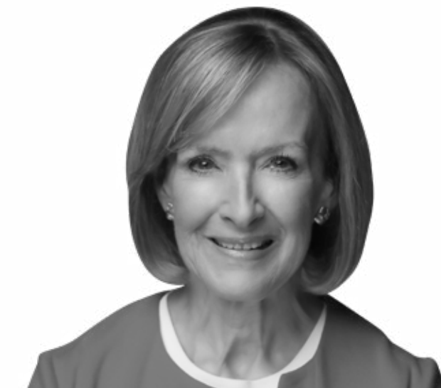
Judy Woodruff, Anchor and Managing Editor, PBS NewsHour