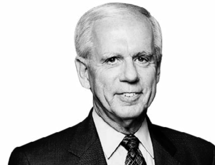
The Honorable Tony Coelho