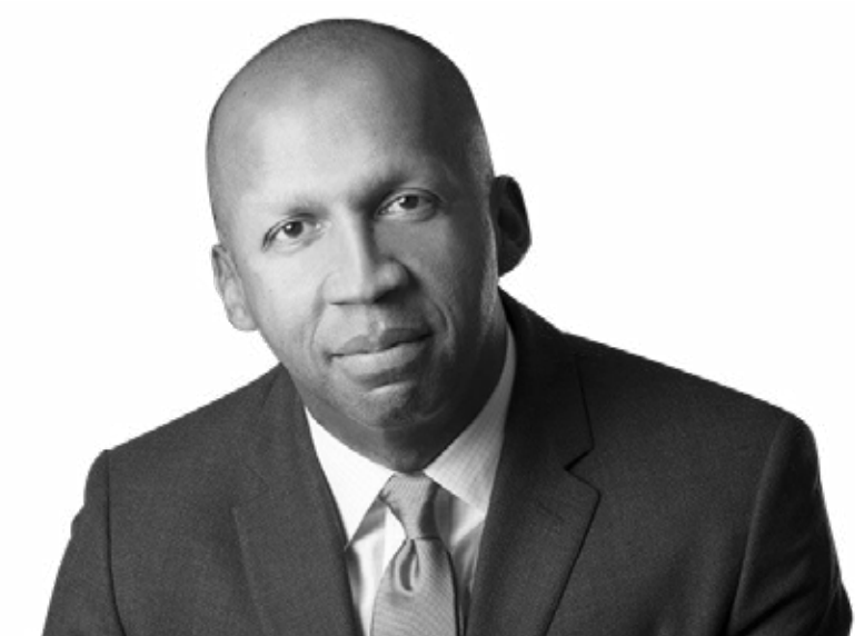
Bryan Stevenson, Founder and Director of the Equal Justice Initiative