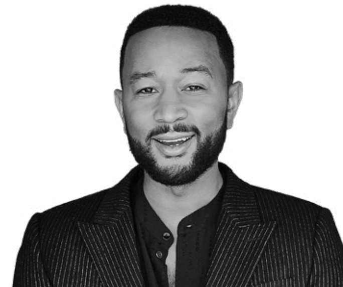
John Legend Artist and Activist