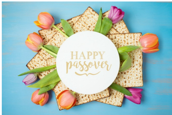
PASSOVER BEGINS FRIDAY, APRIL 15 AND ENDS SATURDAY APRIL 23