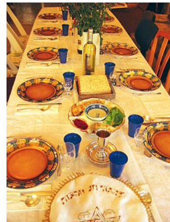
TABLE SET FOR SEDER DINNER

Passover (Pesach in Hebrew) is one of the Jewish religion's most sacred and widely observed holidays. In Judaism, Passover commemorates the story of God's liberating the Israelites from ancient Egyptian slavery. (Hebrew Bible's books of Exodus, Numbers and Deuteronomy).