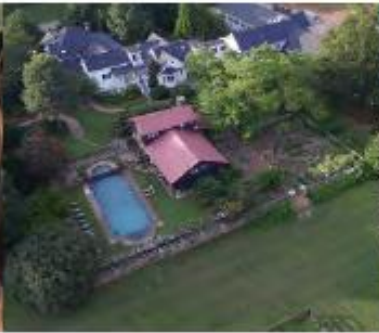
SERENBE HISTORY TOUR