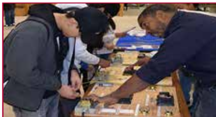
Electricians IBEW Local #134