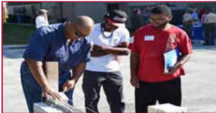
Bricklayers Local #21

To place YOUR ad, e-mail: HGIII@comcast.net or call 312-286-9484 for ad rates