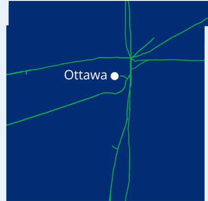
Green line represents Southern Star's pipeline