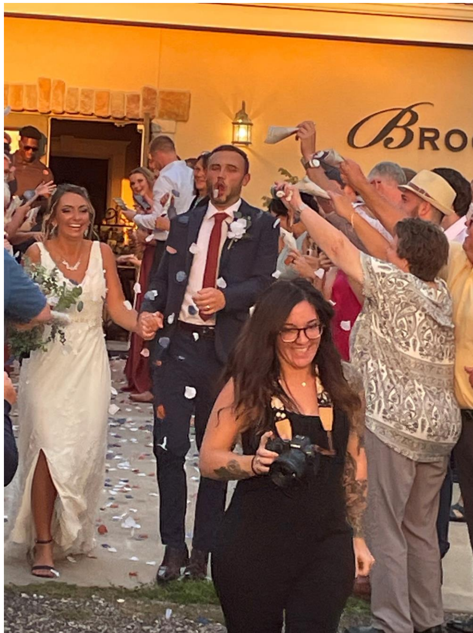
The send off...