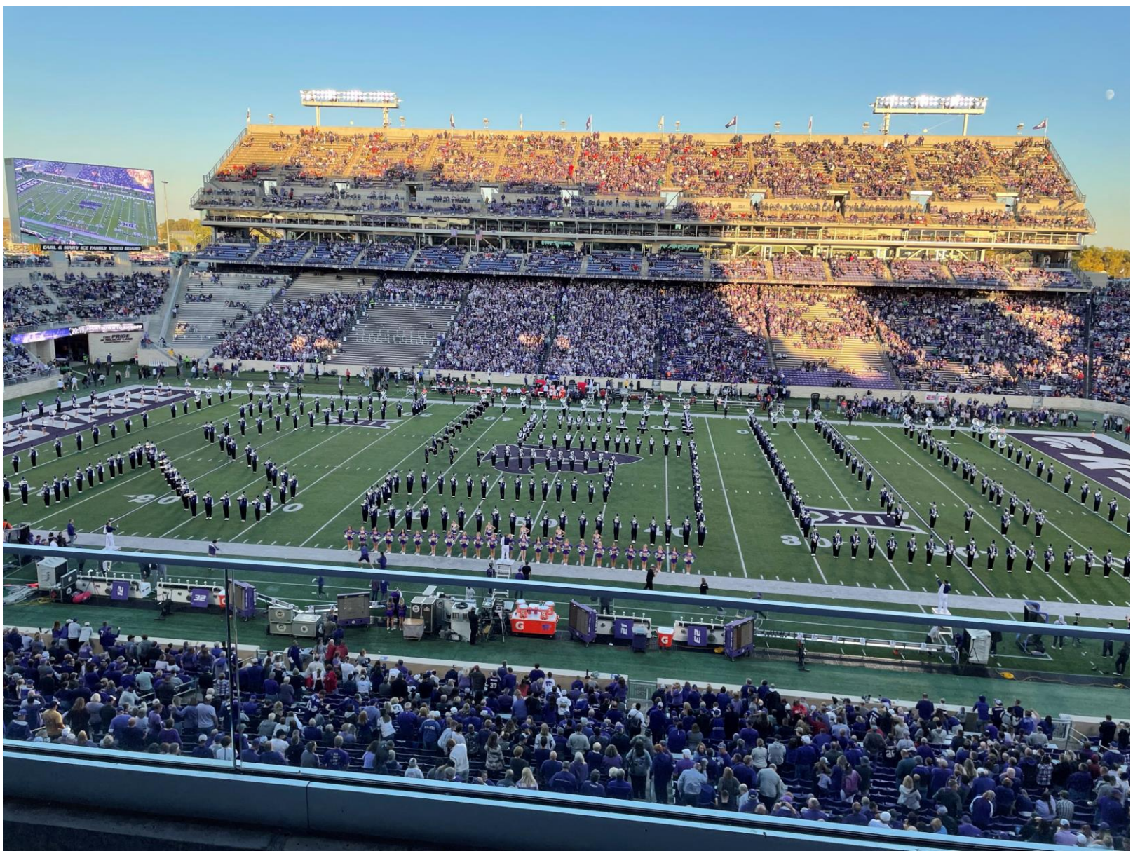
The pride of Wildcat Land...the K-State Marching band...