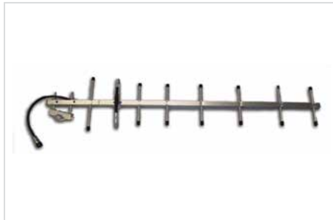
746-896 MHz Yagi Antenna, 11 dBi