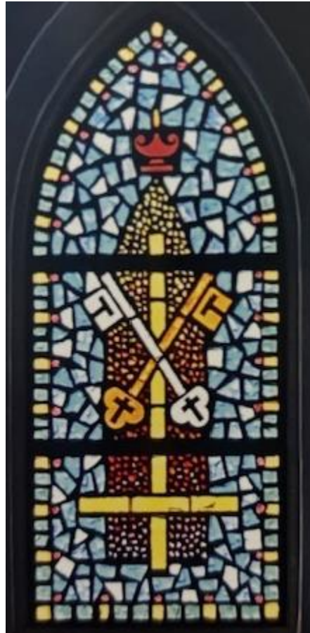
St. Peter's Keys Stained Glass window from St. Peter's Episcopal Church, Honolulu

CHORAL EVENSONG THE CONFESSION OF ST. PETER (tr.) HONORING THE WEEK OF PRAYER FOR CHRISTIAN UNITY 2024 SUNDAY, JANUARY 21, 2024