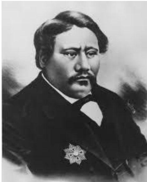
Lot Kamehameha December 11, 1830 – December 11, 1872

The Congregation follows the Procession to Davies Hall where there will be greeting and a reception celebration for all!