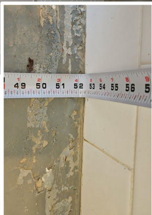
Accessible restroom lacks dimensions at Topstone Park