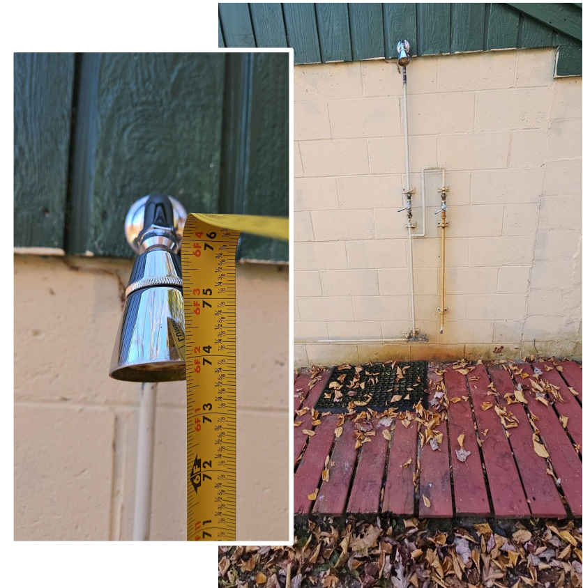
Shower at Topstone Park not of an accessible design