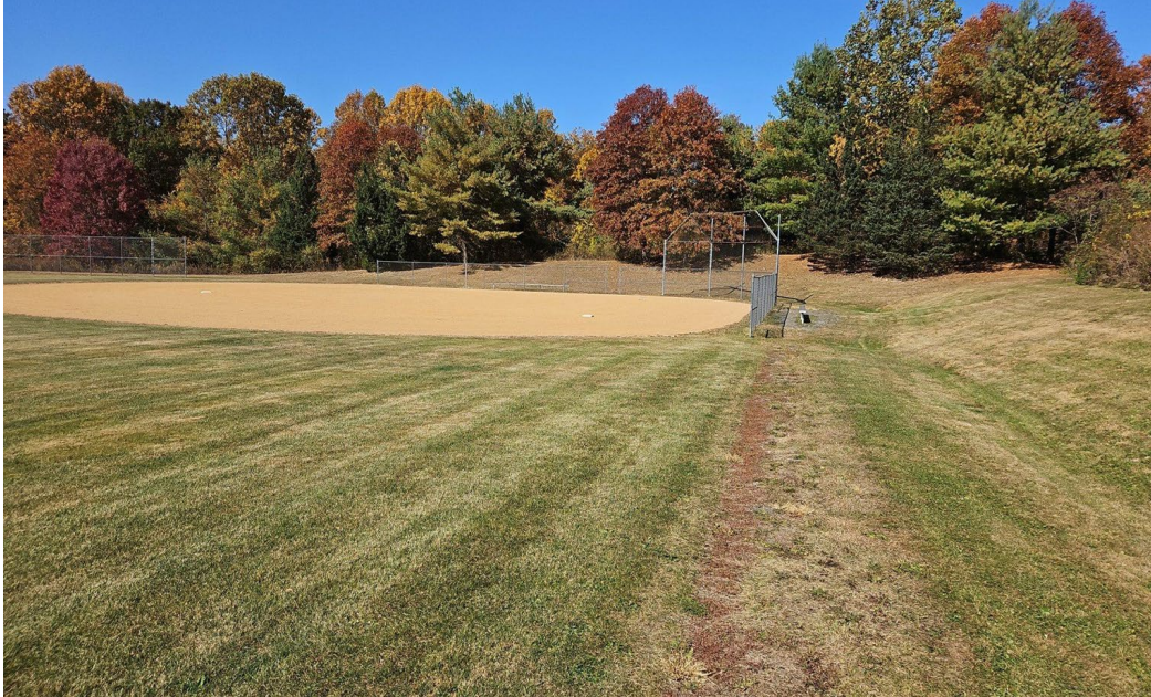
No route to baseball fields at the Community Center