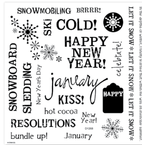
January Word Puzzle