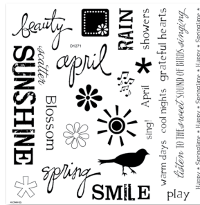
April Word Puzzle