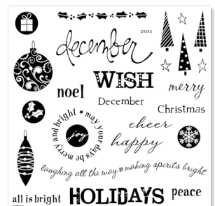
December Word Puzzle

Visit my online business address to learn more: