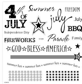
July Word Puzzle