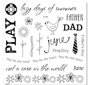
June Word Puzzle