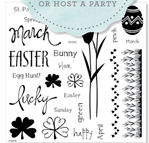
March Word Puzzle