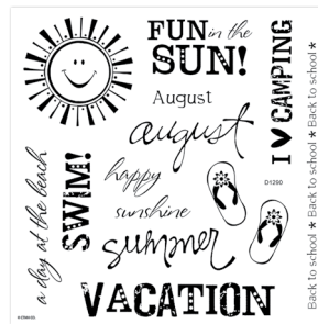
August Word Puzzle