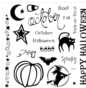
October Word Puzzle