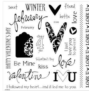
February Word Puzzle