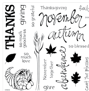
November Word Puzzle