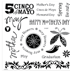
May Word Puzzle