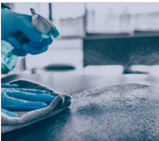
Chemicals & Disinfectants