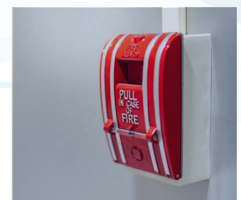
Fire & Safety Systems