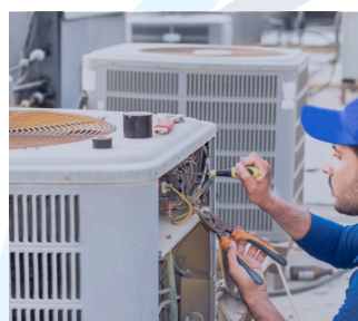
Maintenance, Repair & Operations