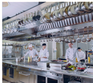
Kitchen Equipment Repair and Spare Parts