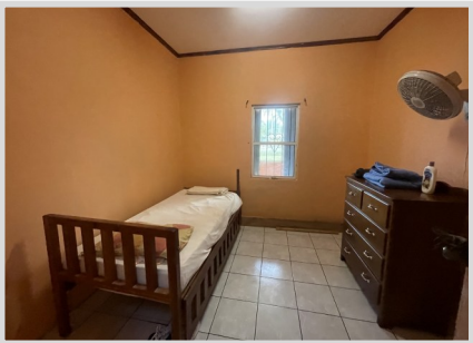
Missionaries/volunteers painted 22 rooms at the Golden Haven Rest Home.