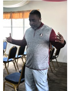
God’s hands and feet in action.