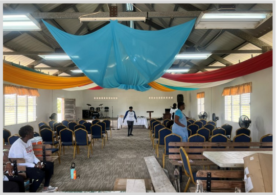
Inside Rhema Assembly of God where bible study is held for children and adults weekly.