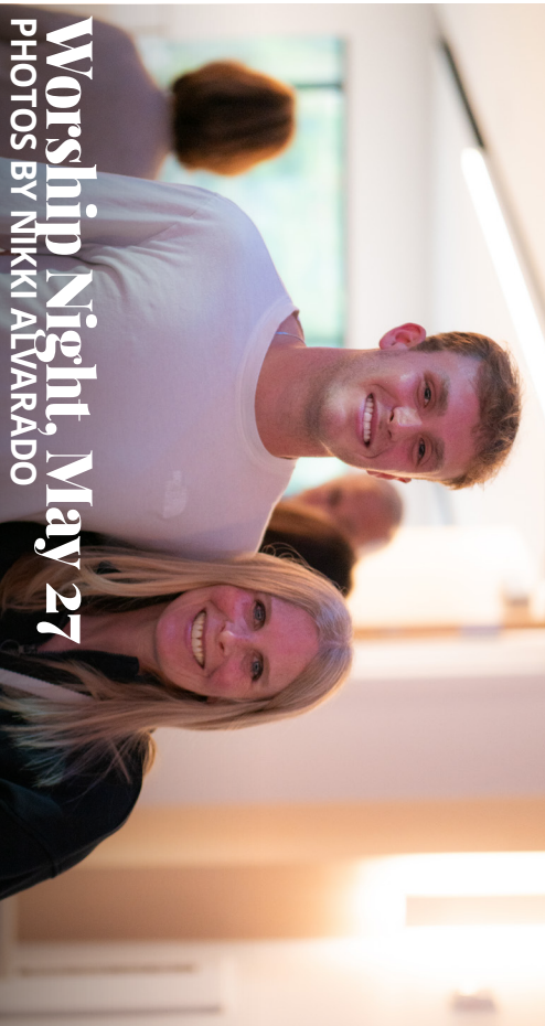
Worship Night, May 27