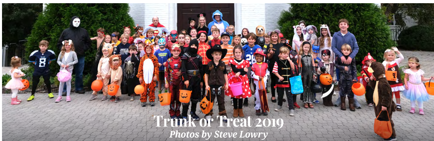
Trunk or Treat 2019