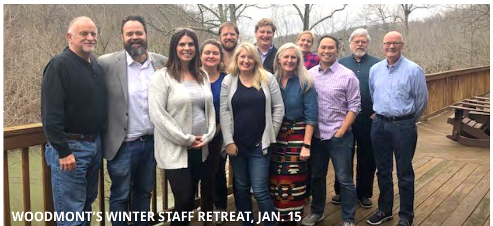
WOODMONT'S WINTER STAFF RETREAT, JAN. 15