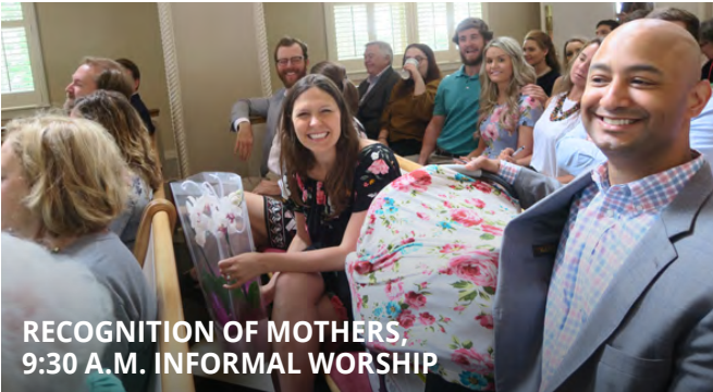
RECOGNITION OF MOTHERS, 9:30 A.M. INFORMAL WORSHIP