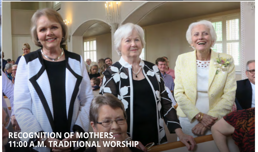
RECOGNITION OF MOTHERS, 11:00 A.M. TRADITIONAL WORSHIP