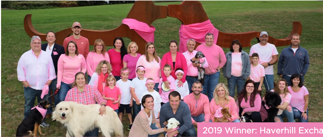
2019 Winner: Haverhill Exchange Club