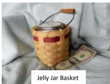
Jelly Jar Basket

Price: $15 for members per session • $35 for non-members per session