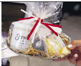
Most of the items available at ScrubzBody are made in-house.

When they opened, the Davidsons decided they wanted to have more women work in