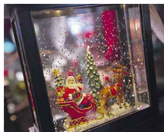
Back in Time sells an array of vintage home décor.

Back in Time (441 Main St., 516-586-8443, backintimedecor.com) boasts an array of vintage home décor — antique, farmhouse and primitive furniture — as well as new items, including candles, clocks and picture frames.