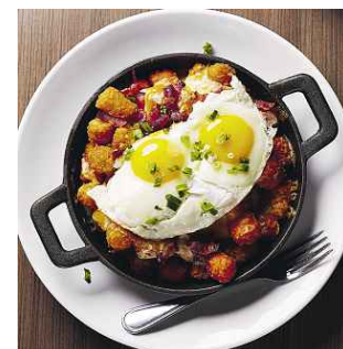
Breakfast poutine is part of Whiskey Down Diner's modern twist on diner fare.

Whiskey Down Diner , 252 Main St., 516-927-8264, whiskeydowndiner.com: The modern twist on a diner serves updated classics (think firebird hot-chicken sandwich with white barbecue sauce) in addition to all-day breakfast and brunch. Cocktails, too. Rolling Spring Roll , 189 Main St., 516-586-6097, therolling.springroll.com: Pho is the ultimate comfort food when soup weather arrives, and this long-time Vietnamese spot is the place to get beef and chicken versions that start with deeply savory housemade broths. Or consider the sandwich superstar banh mi, served on toasted French bread with lemongrass chicken, grilled beef with peanut sauce, or housemade pork belly and pork sausage. Flux Coffee , 211 Main St., 516-586-8979, fluxcoffee.com: Pour-overs, pulled espresso and other serious java concoctions are made to order at the cozy, cheery shop, which has