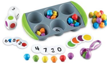
Mini Muffin Match Up