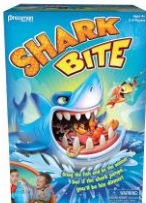
Shark Bite game