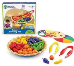
Super Sorting Pie