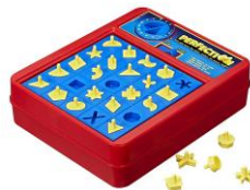
Perfection (25 pieces)