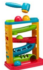
Pound a Ball