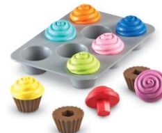
Shape Sorting Cupcakes