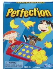
Perfection (9 pieces)