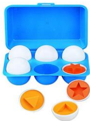
Egg Shape Sorter