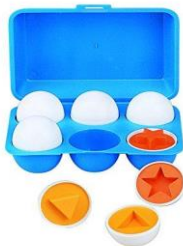
Egg Shape Sorter