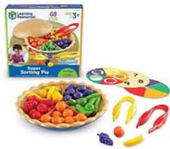
Super Sorting Pie