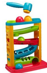
Pound a Ball