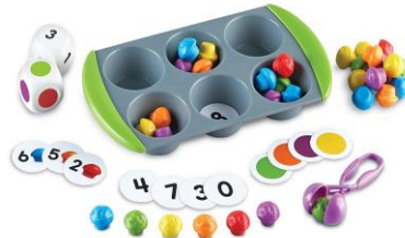
Mini Muffin Match Up