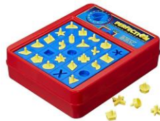
Perfection (25 pieces)