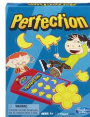
Perfection (9 pieces)