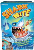
Shark Bite game