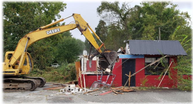
Removing nonconforming buildings and preparing for Toano Station.