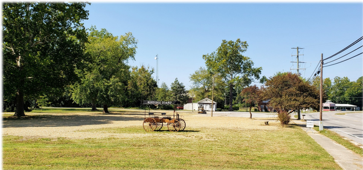
Our new Toano Station Grounds. She cleaned up pretty nice, didn't she?