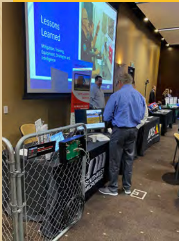
Vendor booths set up around the conference room at the Annual Southwest Security Conference.