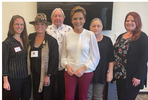
Kari Lake with team Blackstone at the monthly APSPA meeting.

Lake is well known for being a reporter, news anchor and TV personality for over the last 27 years. She impressed many people when Lake, being a person of such high statue, left her career, at the top of her profession, over principals. Lake is a common sense conservative who walked away from the media as a