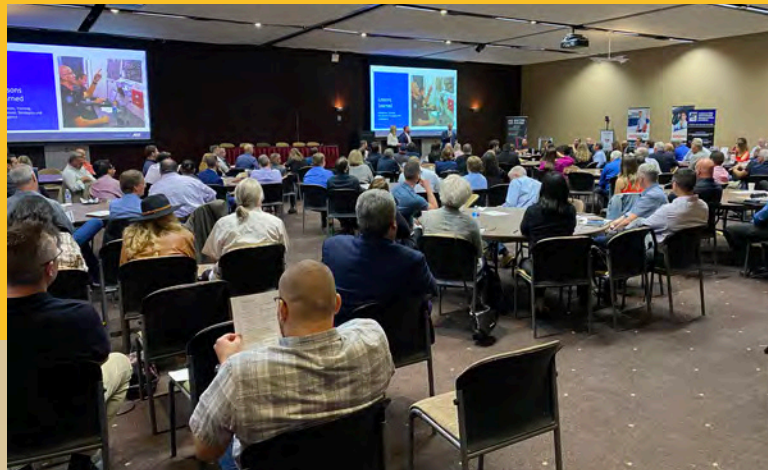
The Annual Southwest Security Conference 2021 at Arizona State University.