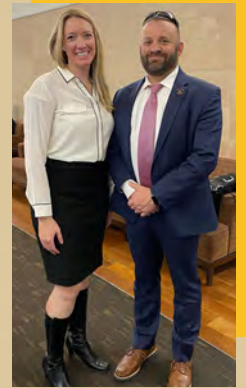
Scottsdale PD at the Annual Southwest Security Conference.