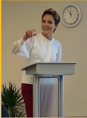
Kari Lake, Candidate Arizona Governor