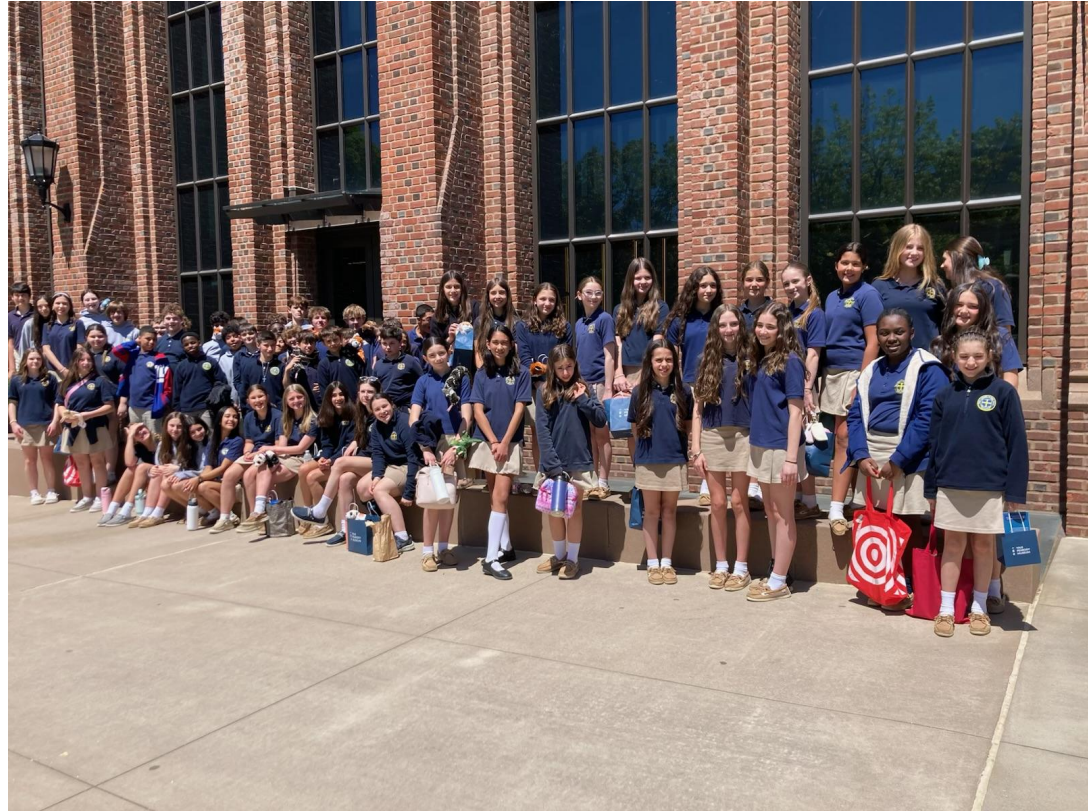
Middle School trip to Peabody Museum