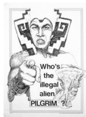
Union labor donated [Prelim21]

#NoThanksNoGiving #FreeLeonardPeltier #KeepItInTheGround