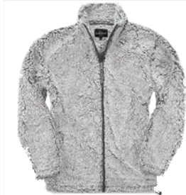
Boxercraft Sherpa Frosty Gray Full Zip w/ Pockets Youth: $55, Adult: $60