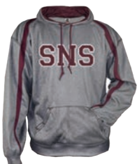
Badger Sport Dri Fleece Hoodie $50 ADULT SIZES ONLY

ADULT S M L XL 2XL add $3 YOUTH S M L XL TOTAL