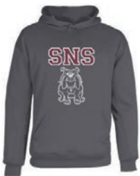
Badger Sport Dri Fleece Hoodie $45 GREY, YOUTH SIZES ONLY