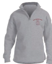
1/4 Zip Cotton Sweatshirt Adult $50 / Youth $42 VINTAGE GRAY

ADULT S M L XL 2XL add $3 YOUTH S M L XL TOTAL