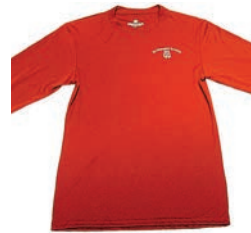
Long Sleeve Holloway Dri-Fit Shirt $25 COLORS: WHITE, MAROON, OR GRAY