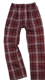
Flannel Pants $32