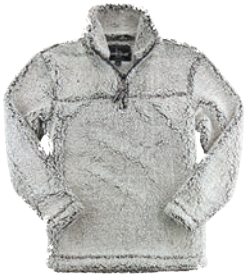
Boxercraft Sherpa Frosty Gray 1/4 Zip Pullover Youth: $55, Adult: $60