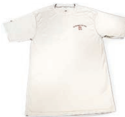
Short Sleeve Holloway Dri-Fit Shirt $20 COLORS: WHITE, MAROON, OR GRAY