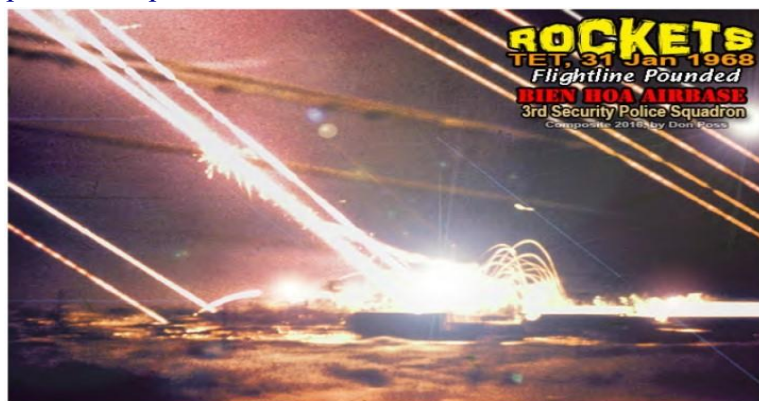
Bien Hoa AB: TET 0300, 31 Jan 1968. Incoming Rockets.

http://www.vspa.com/bhbattle-bunker-hill-10-68.html