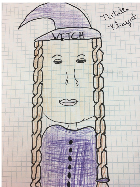
By Natalia Khayat