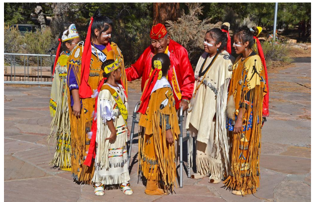
Indigenous People Day