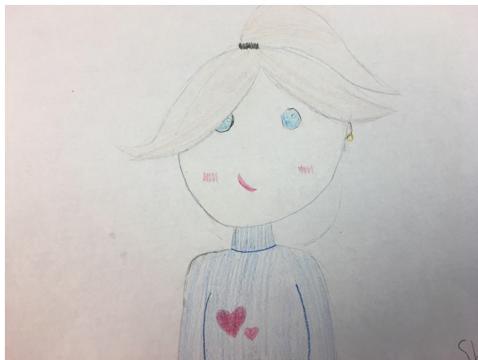
By Shelby Park