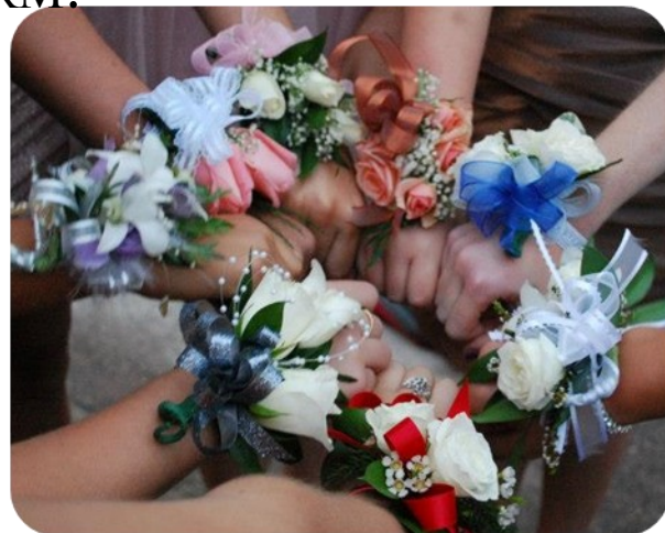
This photo is a representation

NO LATER THAN WEDN OCT. 26TH TURN THEM INTO THE PTSA BOX IN THE FRONT OFFICE