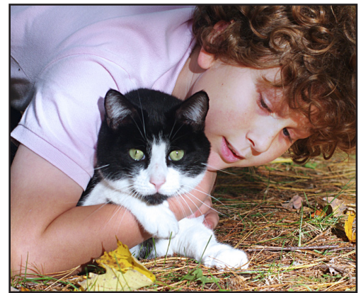
Bandit & Noah, 2008

Bob was the worry cat with his constant look of concern. He was our gentle ambassador to new cat additions. Patches, the first to greet us at the door, was a sweet lady. Nicknamed "Nurse Patches", she sought out and comforted anyone who was under the weather. We return again and again to how much they were loved and needed by each of us. We miss them. The memories of our cats fill the nooks and spaces in our lives.