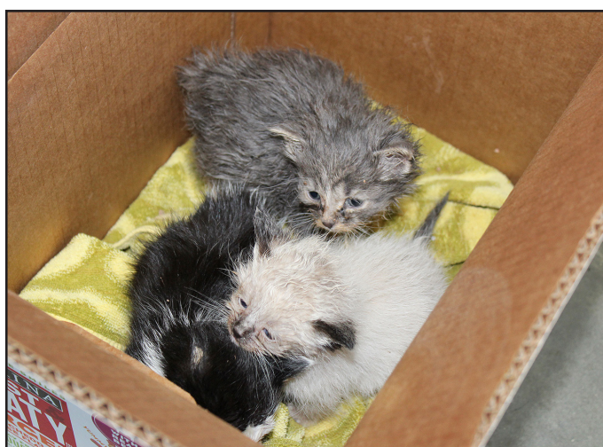
Both this young female dog and her 7 puppies and the 3 kittens were abandoned, but found shelter at the NCSPCA.

An important part of our mission as a no-kill shelter is to decrease the number and the suffering of unwanted animals in our community. Every cat and dog adopted from the NCSPCA is spayed or neutered before adoption. In addition, to make spay/neuter more financially accessible to people within our community, we established SNIP (Spay/Neuter Incentive Program) in 2014. SNIP is a community assistance voucher program. Since its inception, SNIP has helped spay/neuter over 1,100 cats and dogs, which has prevented up to 19,539 litters!