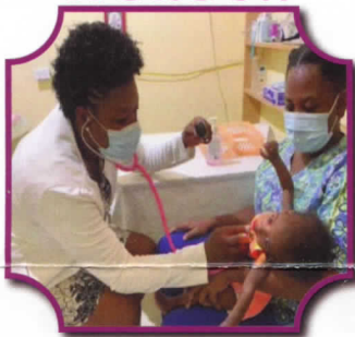
SOLACE & KAY LANMOU

HOPE ALIVE! Clinic is a non-profit organization in Haiti treating the minds, bodies and souls of all ages with all types of diseases and medical emergencies continuously since 1998.