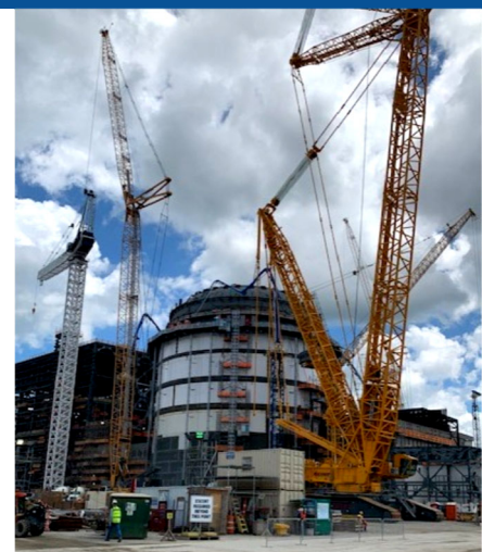
Crews placing concrete on the Unit 4 Shield Building.

On June 4 and June 5, the NI-4 Work Order library was moved to building 122. The library was moved because the existing location (244A) is being demolished to support construction activities. Work Order Library personnel along with day shift laborers completed the mammoth effort of packing, moving, and unpacking over 6,000 work packages in less than 48 hours. Many groups on site were involved with the move.