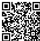
Plate Collection: Today's collection for the church will be taken during Badarak immediately following communion. Your donations remain an essential part of how we support our parish's mission. You can also make an online plate donation through our website, or by scanning this QR code with your smartphone.

22001 Northwestern Hwy. | Southfield, MI 48075 | (248) 569-3405 | stjohnsarmenianchurch.org