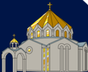
St. John Armenian Church of Greater Detroit