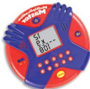
Multiplication Master Electronic Flash Card™ LRN LER6967