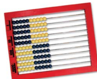
2-Color Desktop Abacus LRN LER4335