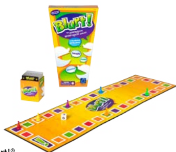
Blurt!® EII 2917