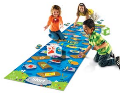
Crocodile Hop™ Floor Game LRN LER9544