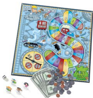
Money Bags™ Coin Value Game LRN LER5057