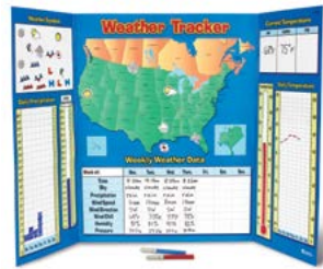
Weather Tracker LRN LER2145