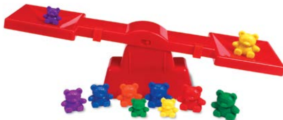
Three Bear Family® Beginner's Balance LRN LER0740