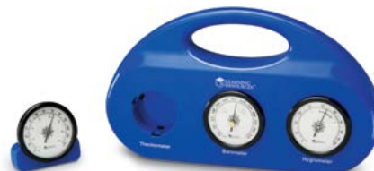
Weather Center LRN LER2940