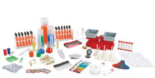
Elementary Science Classroom Starter Kit LRN LER2793