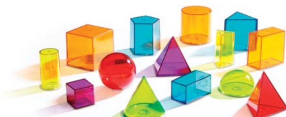
View-Thru® Geometric Solids LRN LER4331