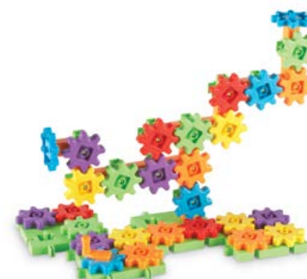
Gears! Gears! Gears! 60-Piece Starter Building Set LRN LER9148