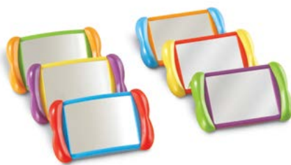
All About Me 2 in 1 Mirrors, Set of 6 LRN LER3371