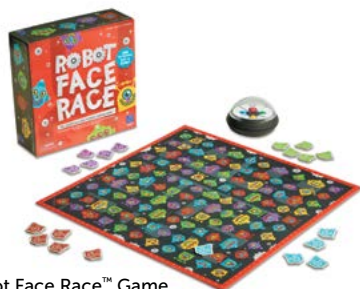
Robot Face Race™ Game EII 2889