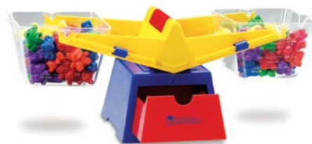
Baby Bear™ Balance Set LRN LER0779