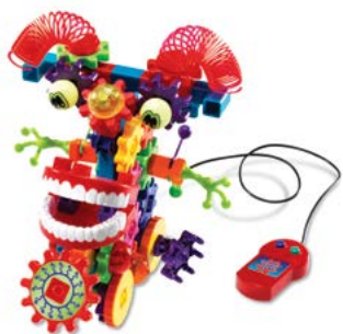
Gears! Gears! Gears! Wacky Wigglers® Motorized Building Set LRN LER9202