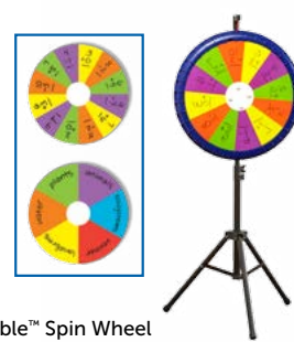
Remarkable™ Spin Wheel EII 8485