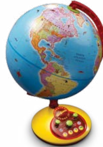
Geosafari® Jr. Talking Globe™ Junior EII 8898