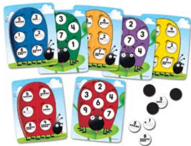
10 on the Spot!™ Ten-Frame Game LRN LER1764