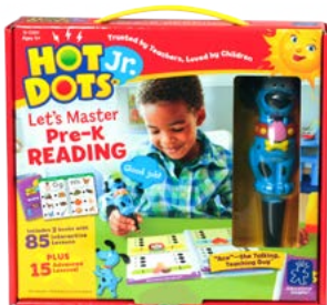
Hot Dots® Jr Let's Master Pre-K Reading Set With Ace Pen EII 2390