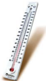
Boiling Point Thermometers LRN LER2415