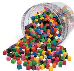
Centimeter Cubes, Set of 1000 LRN LER2089