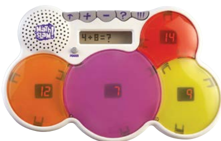
Math Slam™ EII 8476