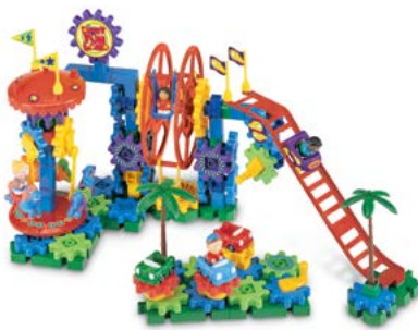
Gears! Gears! Gears! Dizzy Fun Land™ Motorized Building Set LRN LER9199