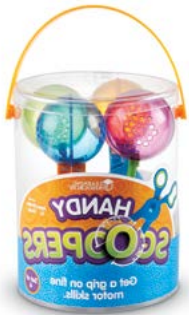
Handy Scoopers™, Set of 4 LRN LER4963