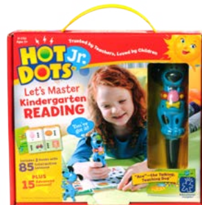
Hot Dots® Jr Let's Master Kindergarten Reading Set With Ace Pen EII 2391