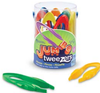
Jumbo Tweezers, Set of 12 LRN LER1963