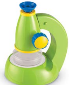
Primary Science ViewScope LRN LER2760