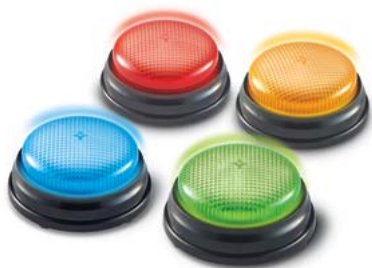
Lights & Sounds Answer Buzzers, Set of 4 LRN LER3776