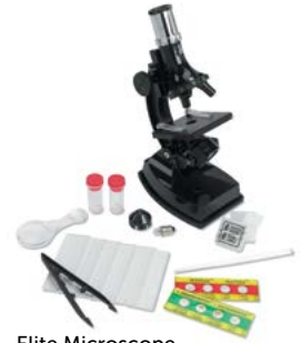
Elite Microscope LRN LER2344