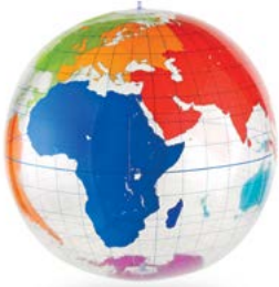
Inflatable Labeling Globe LRN LER2438