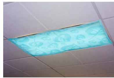
Light Filters For Every Season EII 1233