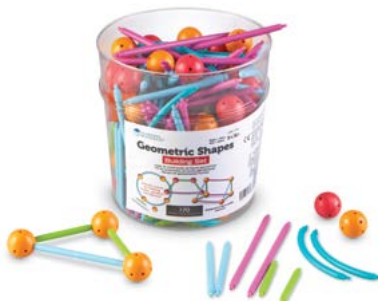
Geometric Shapes Building Set LRN LER1776