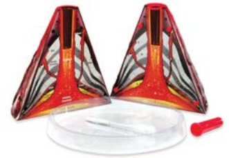
Erupting Volcano Model LRN LER2430