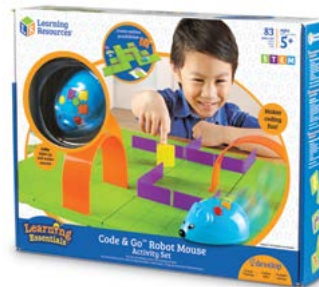
Learning Essentials™ Code & Go™ Robot Mouse Activity Set LRN LER2831