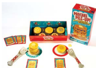
Pancake Pile-Up!™ Relay Game EII 3025