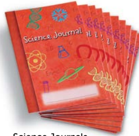
Science Journals LRN LER0389