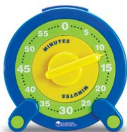
60-Minute Jumbo Timer LRN LER2990