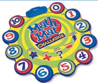
Math Mat Challenge™ Game LRN LER0047