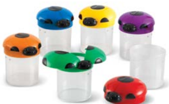
Primary Science Big View Bug Jars, Set of 6 LRN LER2781