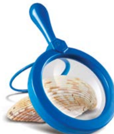
Primary Science Jumbo Magnifiers, Set of 6 (without stand) LRN LER2774