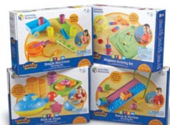
STEM Classroom Bundle LRN LER2834