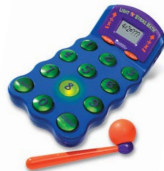
Light 'N' Strike Math® Game LRN LER6906