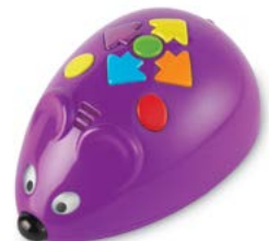
Code & Go™ Robot Mouse LRN LER2841