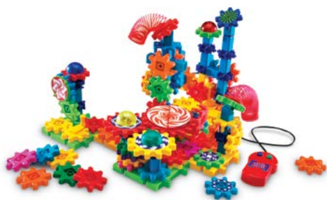
Gears! Gears! Gears! Lights & Action Motorized Building Set LRN LER9209