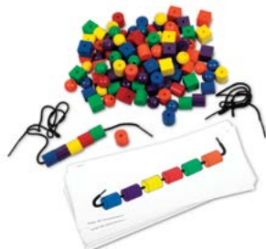
Beads & Pattern Card Set LRN LER0139