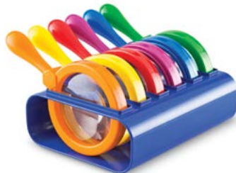
Primary Science Jumbo Magnifiers, Set of 6 (with stand) LRN LER2884