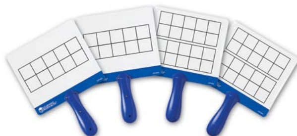
Magnetic Ten-Frame Answer Boards LRN LER6645