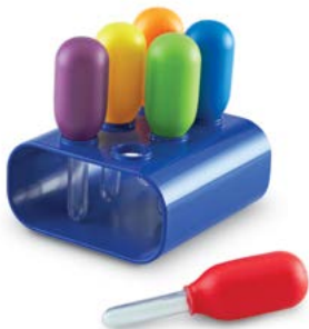
Primary Science Jumbo Eyedroppers with Stand LRN LER2779