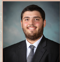
First College Pontifical College Josephinum St. James the Greater, Charles Town

WOULD YOU LAY DOWN YOUR LIFE FOR THE SALVATION OF SOULS?