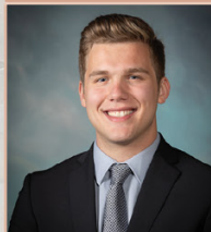
Second College Saint John Paul II College Seminary St. Patrick, Weston