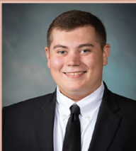
Second College Saint John Paul II College Seminary St. Patrick, Weston