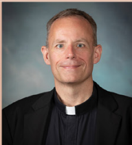
Third Theology Mount Saint Mary's Seminary Sacred Heart of Mary, Weirton