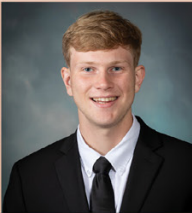
First Philosophy Pontifical College Josephinum Sacred Heart Co-Cathedral, Charleston