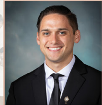
First Philosophy Mount Saint Mary's Seminary Sacred Heart Co-Cathedral, Charleston