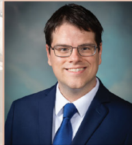
First Philosophy Mount Saint Mary's Seminary Our Lady of Peace, Wheeling