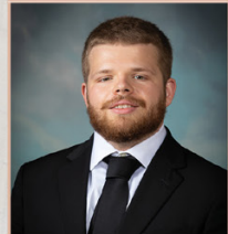
Second Philosophy Mount Saint Mary's Seminary St. James the Greater, Charles Town