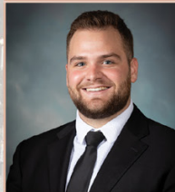
Second Philosophy Mount Saint Mary's Seminary Sts. Peter and Paul, Oak Hill