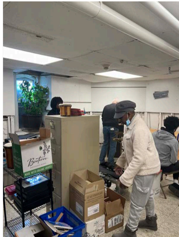
Pictured: Clean out of the Choir room