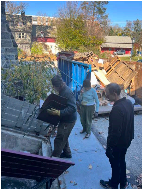
Pictured: Clean out of the basement