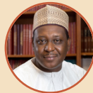
Dr Muhammad Ali Pate

Global Director Health Nutrition & Population, Global Practice at the World Bank