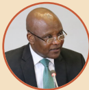
Dr John Nkengasong