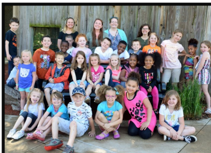
5 th Quarter Summer Learning