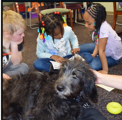
After School Program