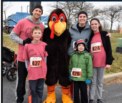
Turkey Trot 5K Run