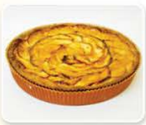
Almond Apple Tart

Sunflower Bakery is a 501(c)(3) nonprofit organization