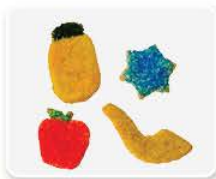
Rolled Sugar Cookies